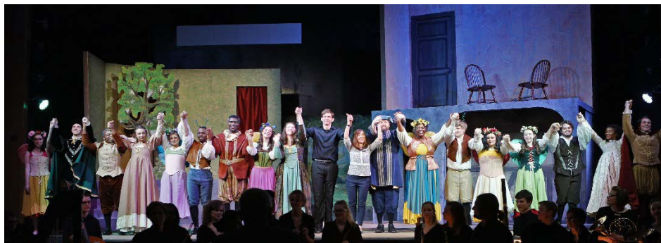
Die Lustigen Weibern von Windsor , Spring 2017